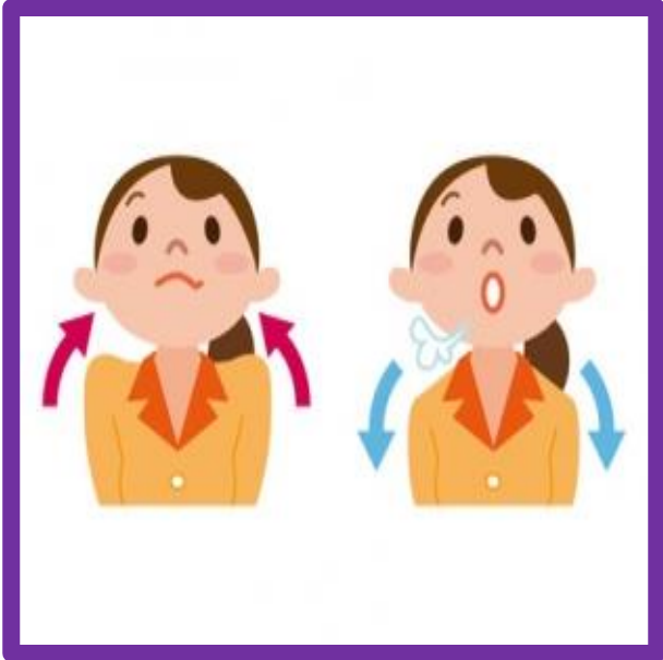
Take a deep breath