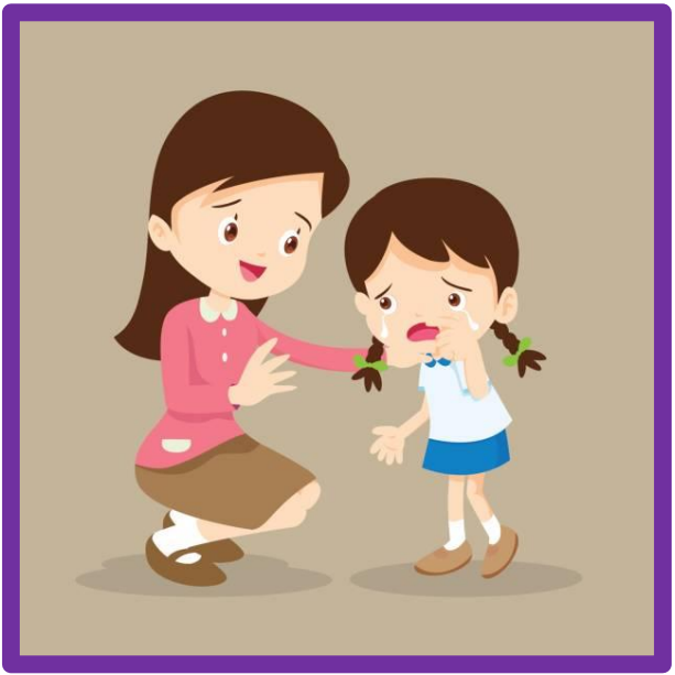
Use your words